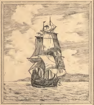
SAN CÁRLOS 1769